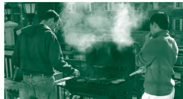
Worship at Pres House always continues with fellowship over dinner, usually brought by a Madison church, but sometimes cooked by students or staff as seen here on Graduation Sunday.