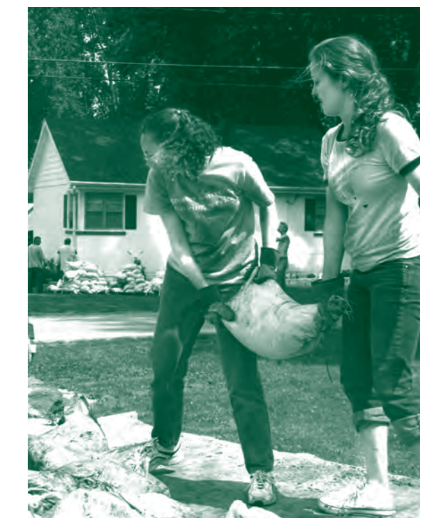
“Volunteering doing Flood Relief for at St. Vincent De Paul food pantry is very rewarding because you get to give back to the community.”