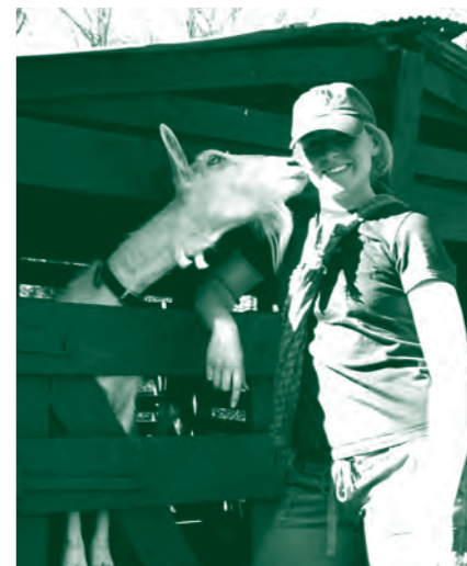
“Pres House has given me the opportunity to meet and spend time with many students that have God in their lives, and retreats and mission trips provide extra time to grow closer in these relationships as well as getting away from the stress of college life to spend time with God in a different setting.”