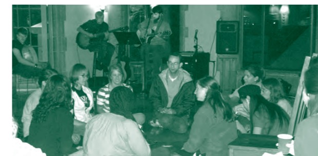
Some fellowship events, such as the September Music Cafe in Pridham Lounge shown here, occurred on week nights. Small groups also met on week nights.

“I really appreciate how personal the people are at Pres House. During my first visit, I was greeted and asked to share dinner, conversed with... and during my second visit, people actually remembered who I was :) That made a big difference to me. I also enjoy how the staff there makes a point to get to know you personally. That really helped, especially for a freshman just starting out in Madison. Thanks!”